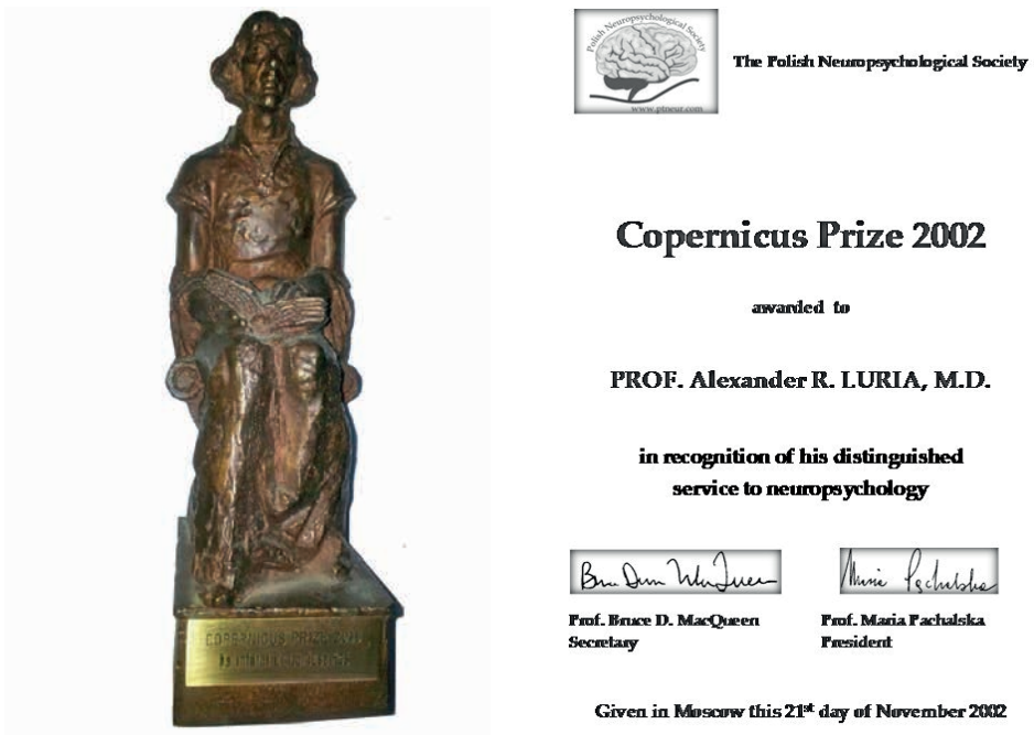
Figure 2. The highest award of the Polish Neuropsychological Association — The Copernicus Prize 2002 — posthumously presented to mark the 100 th anniversary of the birth of A. R. Luria.